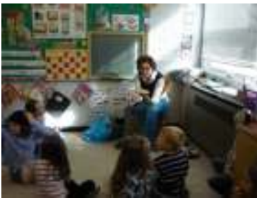
Wycliffe Bible Translators blessed us with the presence of one of their staff at our Oct. 22 Chapel. She also spent time in each of the classrooms.

Palliser Regional Schools is pleased to now be publishing a monthly newsletter - "The Pulse." To subscribe, visit the home page of the Palliser website at www.pallisersd.ab.ca ("Division Newsletter"). Previous issues are also available by visiting the website.