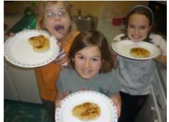
MMMM GOOD! The grade 3/4 class was cooking up some griddles.